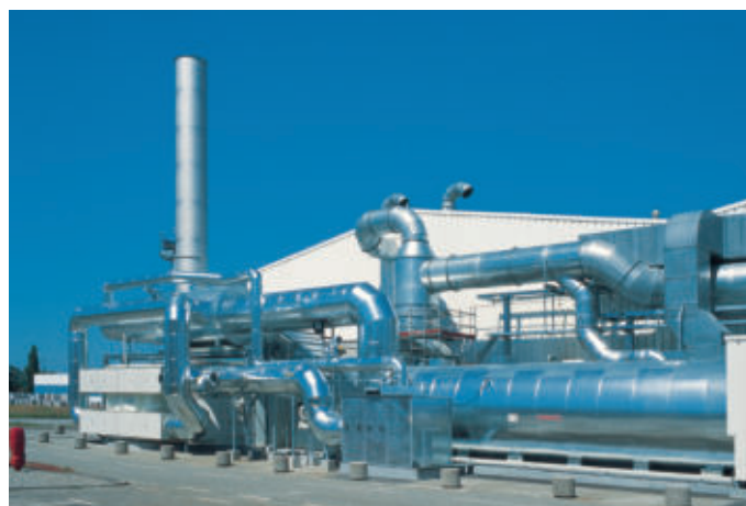
Exhaust air treatment by adsorption.