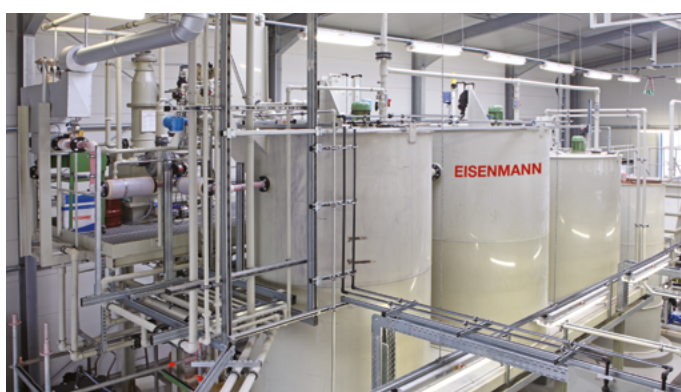
Plant for pesticide treatment